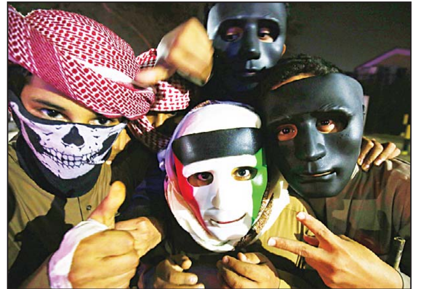
Kuwaiti boys wearing masks pose for the camera in Kuwait City on Feb 16, as the country begins to prepare for their independence day celebrations.